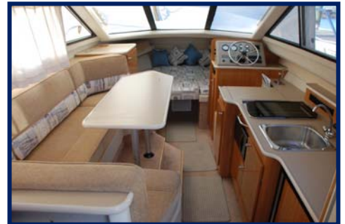
Main Salon Forward