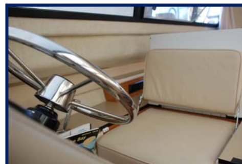
Lower Helm Folding Backrest