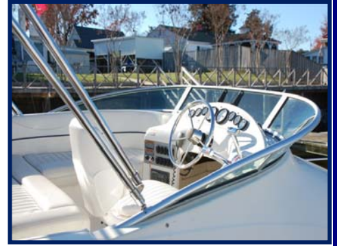
Upper Helm Wrap-around Seating