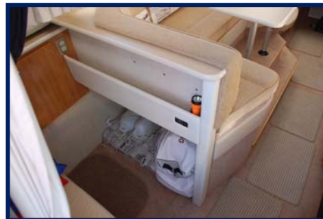
Under Dinette Berth