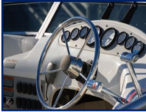
Upper Helm Instruments