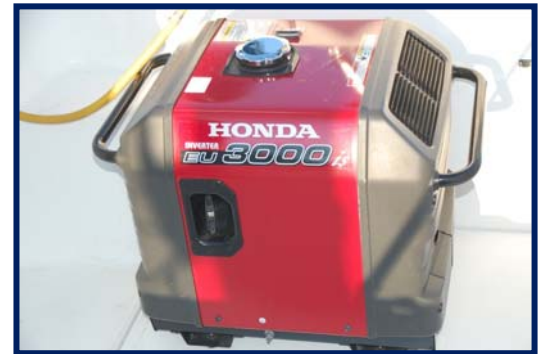
Generator conveys w/vessel