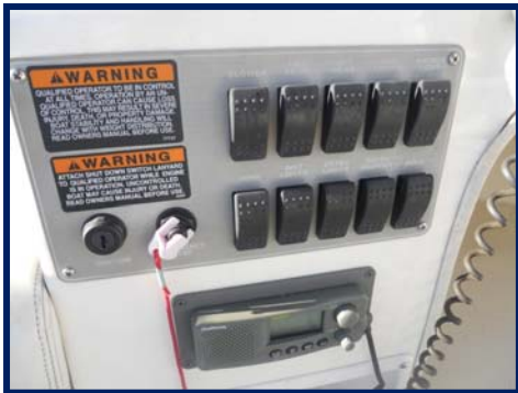
Upper Helm Switch Panel