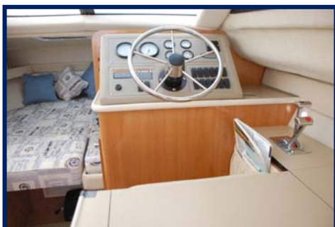
Lower Helm Station