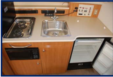
Galley (Fridge Open)