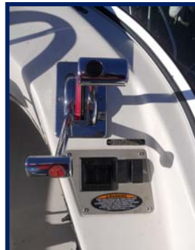
Upper Helm Throttle Quadrant