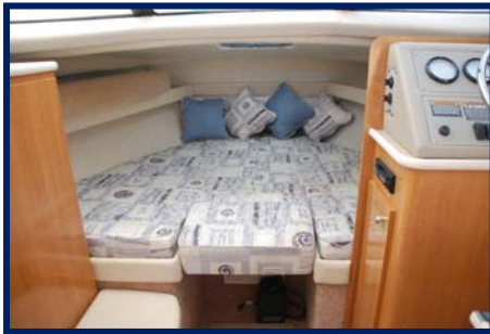
V-Berth w/Storage Under