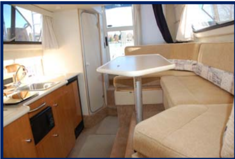
Main Salon Aft