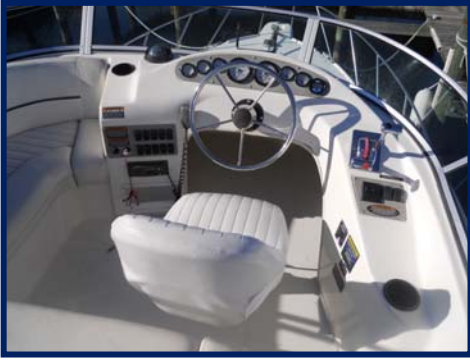
Upper Helm Station