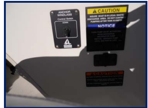
Upper Helm Windlass Control